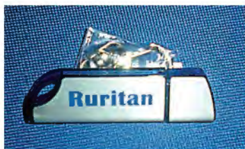
128 MB Ruritan Flash Drive- $9