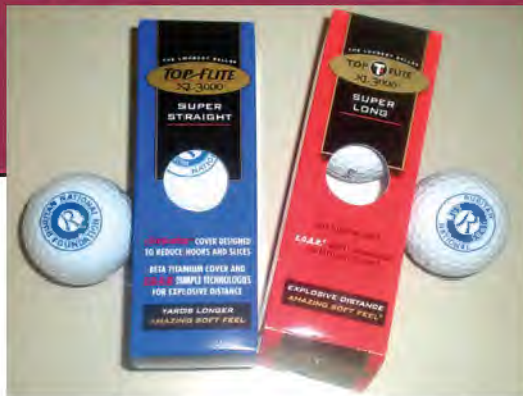
Ruritan golf balls Sleeve of 3- $6.50 Box of 12- $24