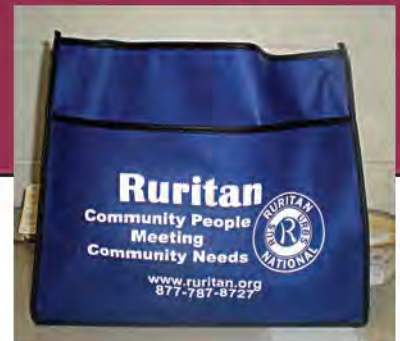
Ruritan Tote Bag- $5