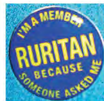
1 1/2 " button: I'm a Ruritan Because Someone Asked Me. (limited quantity)- $.35 each

Call (800) 836-5431 or send this order form to Ruritan Supply, P.O. Box 487, Dublin, VA 24084