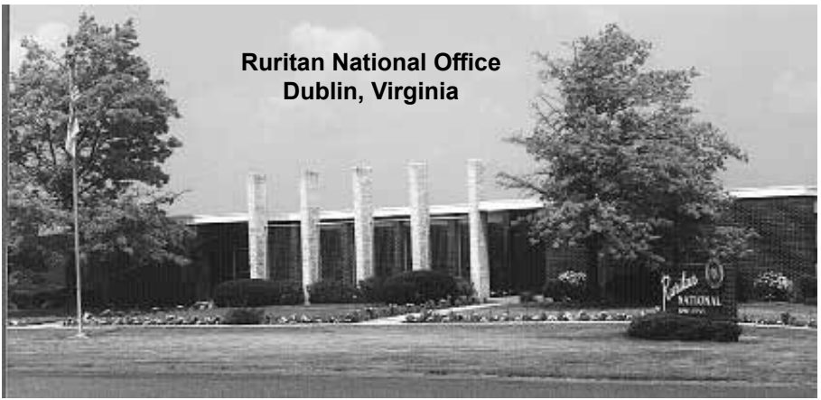
Ruritan National Office Dublin, Virginia